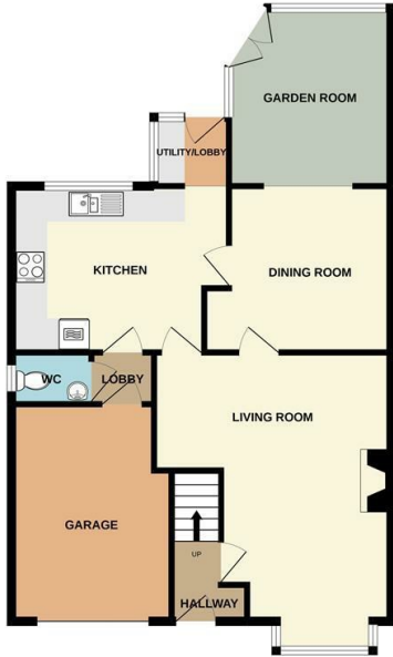
GROUND FLOOR 801 sq.ft. (74.4 sq.m.) approx.